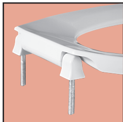
PLASTIC HINGES WITH STAINLESS STEEL POSTS AND PINTLES